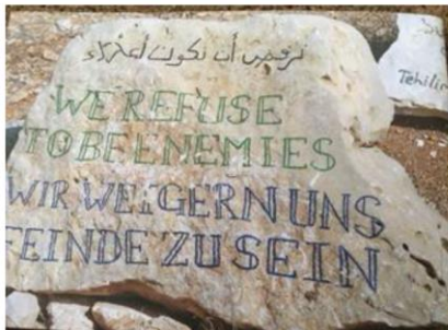
Sign at entrance to Daoud Nassar's farm, SW of Bethlehem