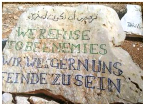
Sign at entrance to Daoud Nassar's farm, SW of Bethlehem